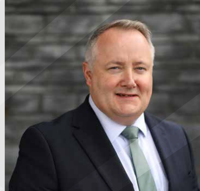
Darren Millar MS Leader of the Welsh Conservatives

Together, let's fix Wales and get Wales working.